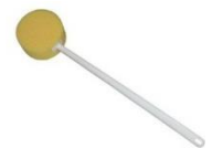
Long-Handle Bath Sponge $6.99

All prices are subject to change without notice. Call first for prices and availability.