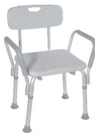
Shower Chair w/Arms $79.99-$94.99