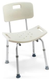
Shower Chair $49.99