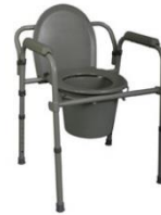
3-in-1 Commode $64.99