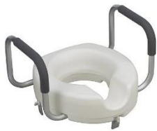
Raised Toilet Seat w/Arms $65.95