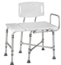
Bariatric Tub Transfer Bench $149.99