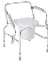
Drop-Arm Commode $113.99