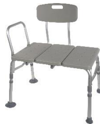
Tub Transfer Bench $98.95