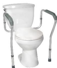
Toilet Safety Frame $49.99