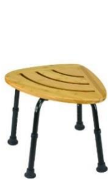
Bamboo Shower Stool $69.99