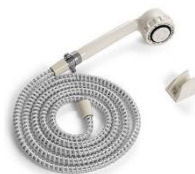
Handheld Shower Extension $24.99