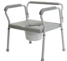
Bariatric Commode $119.99