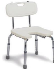
Shower Chair w/Commode Opening $69.99