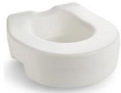
Raised Toilet Seat $55.99