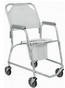
Mobile Shower Chair $169.99