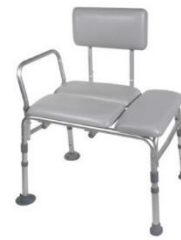
Padded Tub Transfer Bench $139.99