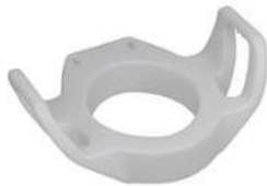
Raised Toilet Seat w/Arms Elongated $69.99